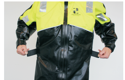
Adjustment with velcro in waist for snug fit