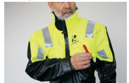
Oral inflation tube