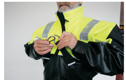
Lifting strap with stainless steel carbine hook and D-ring (3200N)