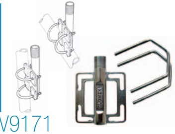
electropolished stainless steel pipe mounting bracket for vertical or horizontal mounting. Thread 1"x14 UNS male