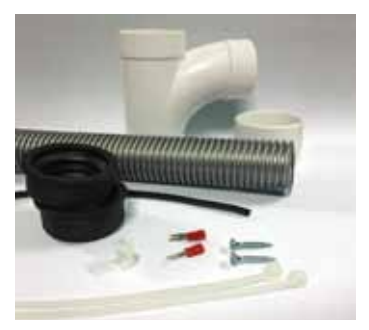
Installation material for extra inlet valve

Set of 5 dust bags (3,5L a bag) + 1 motor filter Art.100026