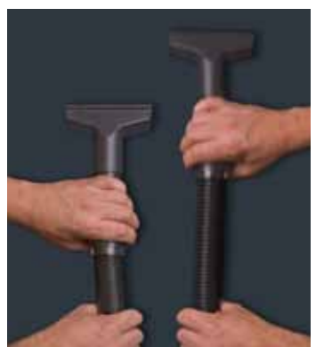
Extendable hose, light weight

Beflexx extendable hose incl. Comfort handle. (0,80 to 3m) Art.100030